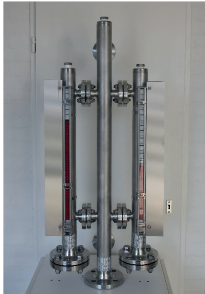
Model: MLB duo

Our magnetic level gauges are not only suitable for various applications, but are also available in a variety of models and sizes. The parts of the device are by default made of stainless steel (SS316L). It is possible to provide the measuring tube with a protective layer of insulating material. A layer of Armaflex will prevent crystallization of the liquid. Fiberglass tape is used to avoid heat loss in the tube and also to prevent your fingers getting burned.