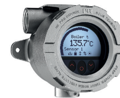
Stainless steel junction box with local display

humidity or even corrosive, acidic substances. As an option the standard level gauge can also be supplied with electronic components such as switches and transmitters like reed chains. In addition the possibility exists to order a magnetic level gauge with a bypass bridge chamber including a radar sensor.