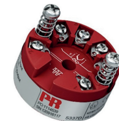
Adjustable transmitter head of PR Electronics

What are magnetic level gauges used for and what makes them so easy to use? They are used for measuring the level of the liquid in a closed tank or vessel and to make the liquid level visually visible on an indication rail. Our magnetic level gauges can be used as well to measure the interface level between two liquids in the same tank. They are maintenance free and are unaffected by dust, shocks, vibrations, high temperatures,